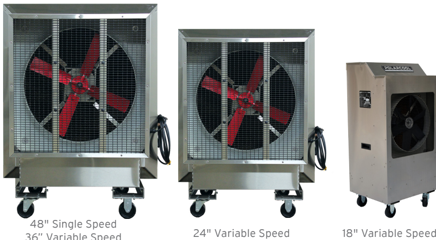
48" Single Speed 36" Variable Speed